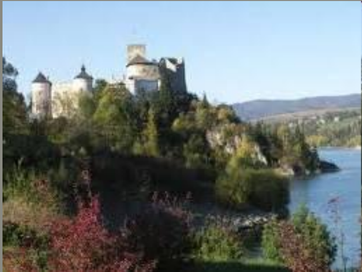
CASTLE IN NIDZICA